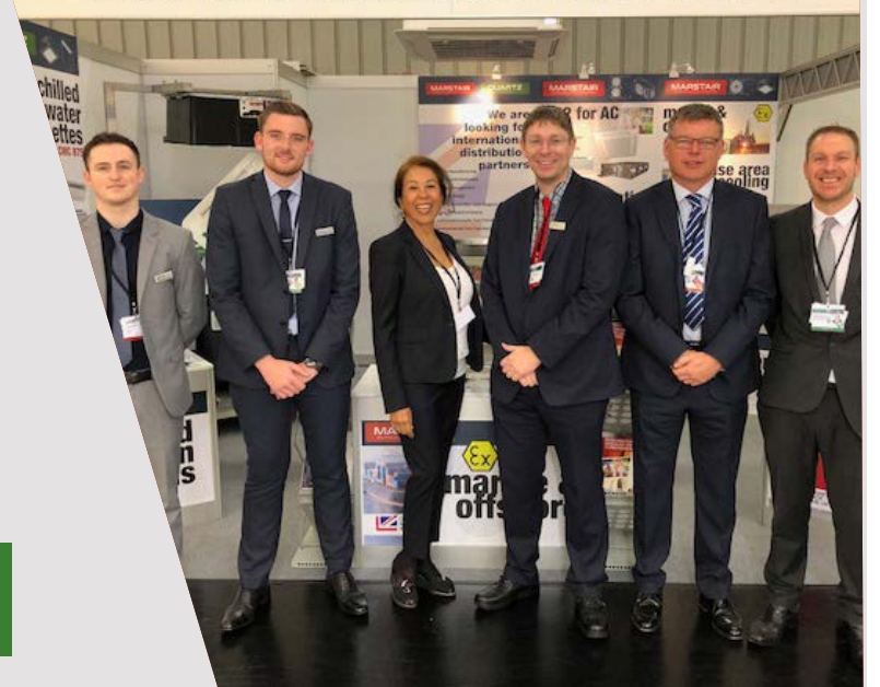
Marstair / Quartz divisions of TEV